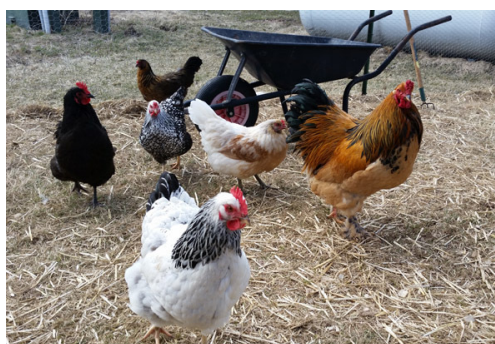
From left to right - Ruby, Dandelion, Gumdrop, Bluejay, Orchid, and Roscoe the rooster.