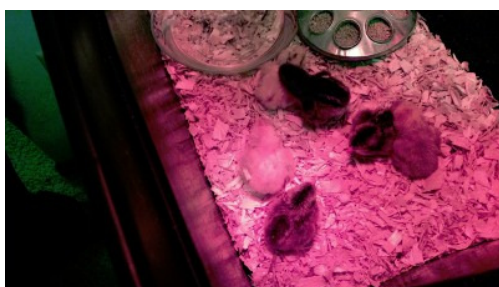
From left to right - 1 of 5, 2 of 5, 3 of 5, 4 of 5 and 5 of 5

"We are at peace in this serene and private space where we, and invited guests, learn from one another and the land, connect with mother earth, and live in the moment. With help from earth-loving souls, we enable the land to care for itself and provide food, medicine, materials and habitat."